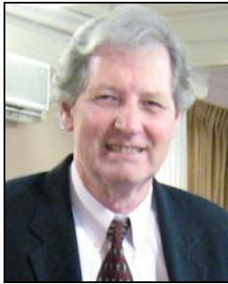
Welcome to our English Department e-Newsletter.

In response to the Fall newsletter, we received a number of alumni updates, comments, and reminiscences. Please be sure check out what your fellow alumni have been up to. Visit the alumni website, www.english.neu.edu/alumni/ , and while you're there, take a moment to drop us a line .